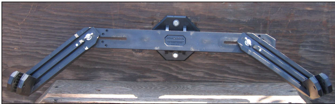
Pic 2 – Bowkaddy set for Mathews parallel limbs

Pic 1 – One pin falls into outside bottom hole on main support arm; the other pin falls outside main support arm. The friction of the rubber washer between the 2 pieces stabilizes Bowkaddy during bow insertion, after which the bow itself will provide stability.